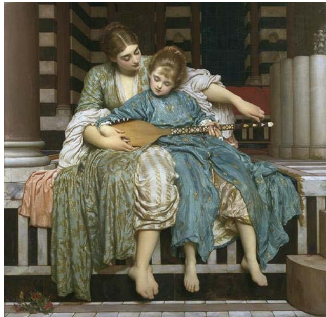
Frederic, Lord Leighton The Music Lesson 1877

The COLLAGE database contains over 31,000 images and records of Guildhall Art Gallery's and Guildhall Library Print Room's collections. COLLAGE is available on terminals within the Gallery, elsewhere in the Guildhall complex and at selected City of London libraries. It is also on the internet at http://collage.cityoflondon.gov.uk