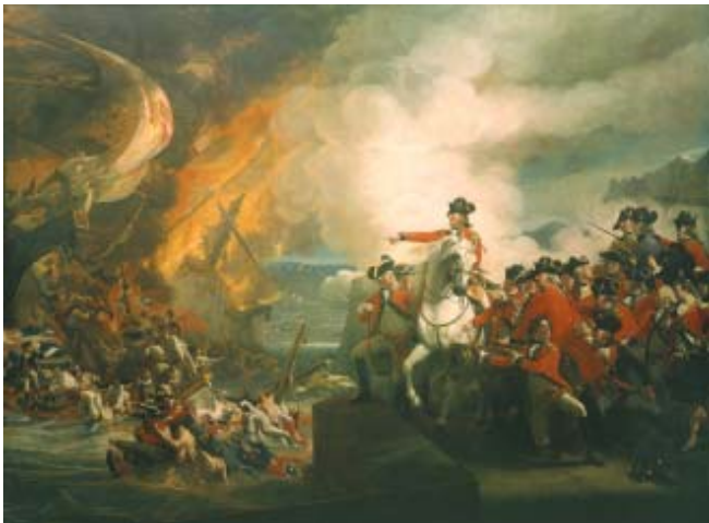
John Singleton Copley Defeat of the Floating Batteries 1783-91

Displays are changed regularly, and there is an annual programme of temporary exhibitions. Only a small part of the collection can be shown at any time. Arrangements may usually be made to see works of art not currently on view. Telephone 020 7332 1856/3404/1632.